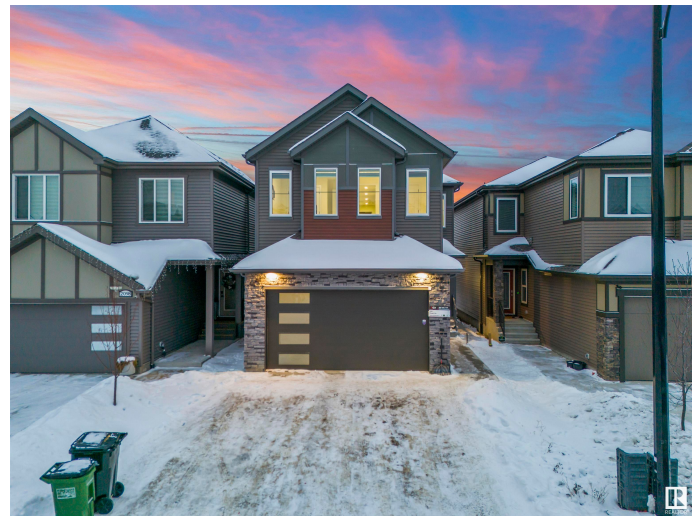
2096 Graydon Hill Cres SW, Edmonton, AB

1st Floor Exterior Area 1223.15 sq ft Interior Area 1121.19 sq ft Excluded Area 170.94 sq ft