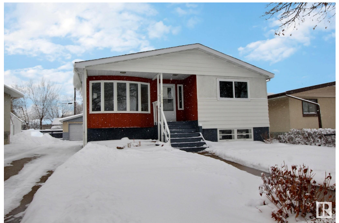
12136 38 St NW, Edmonton, AB

MLS® # E4428099 Price $385,000 Bedrooms 5 Bathrooms 2.00