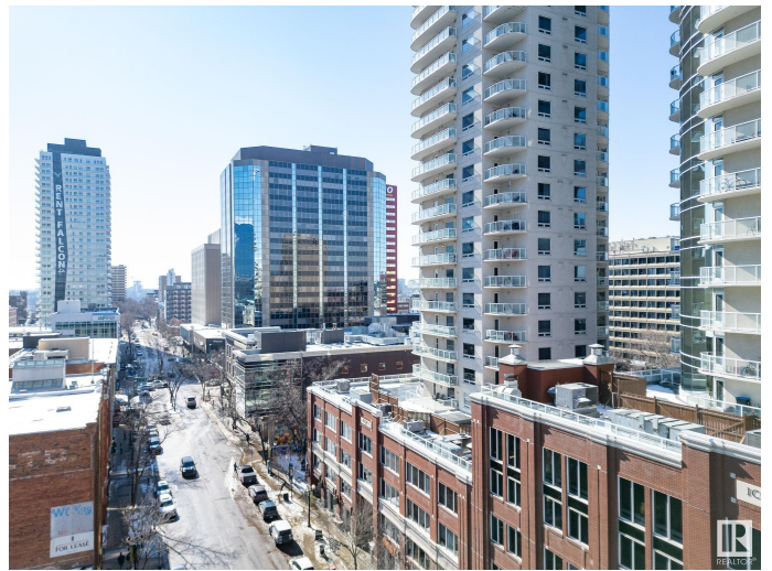
701-10136 104 Street NW, Edmonton, AB