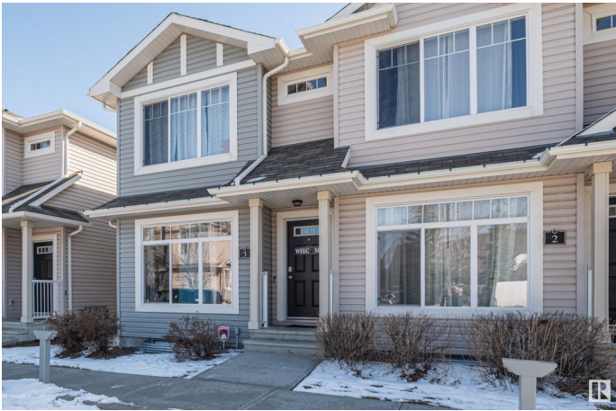
3-6032 38 Ave NW, Edmonton, AB

Main Floor Exterior Area 487.63 sq ft Interior Area 437.16 sq ft